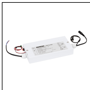
GWS2992 Emergency kit 3h